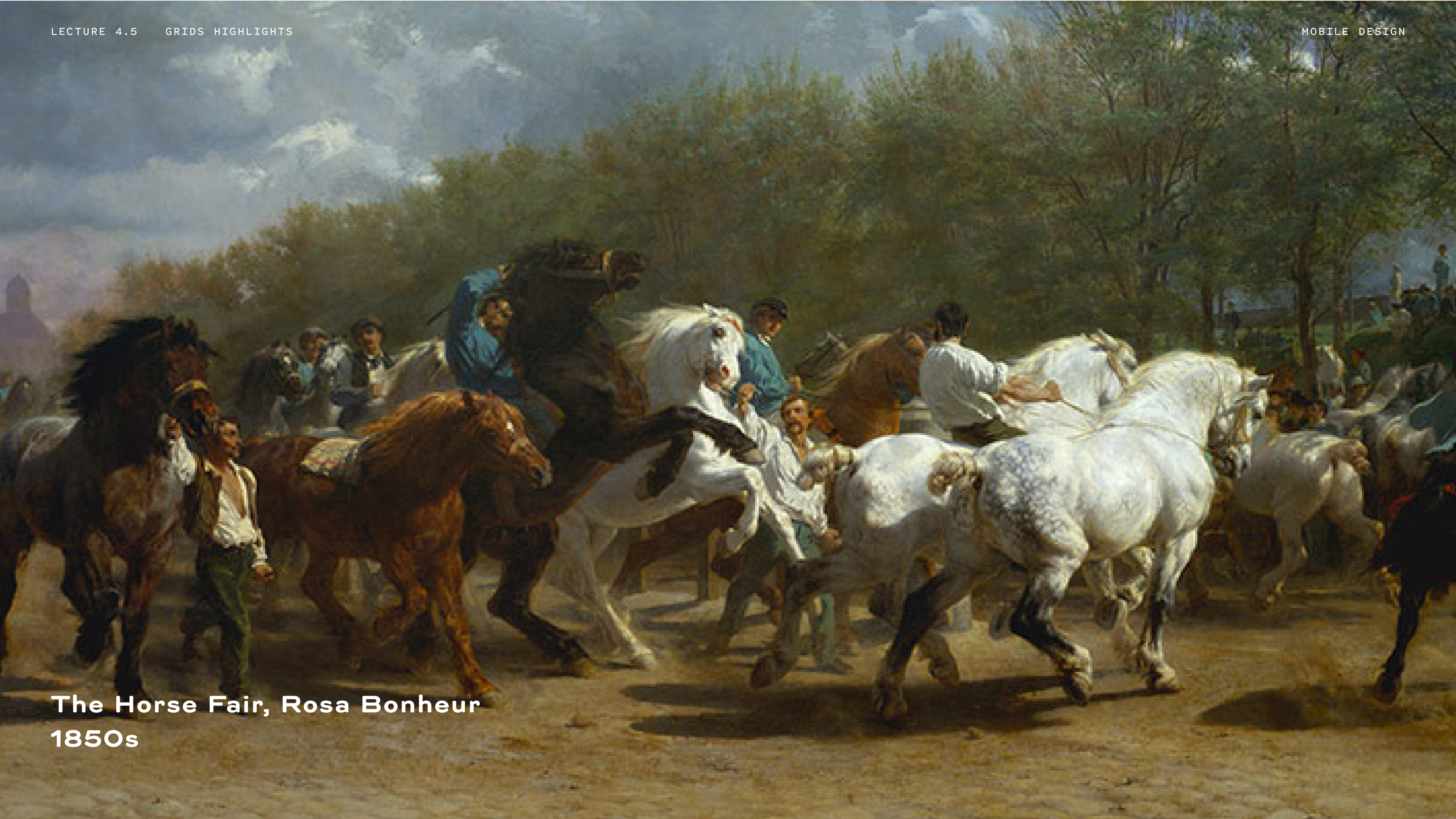
The Horse Fair, Rosa Bonheur 1850s